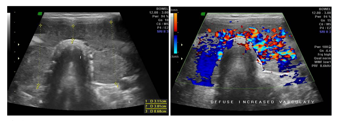
Fig-6: Grave's Disease: Diffusely bulky and hypoechoic echotexture of thyroid with hyper-vascular pattern (thyroid inferno)