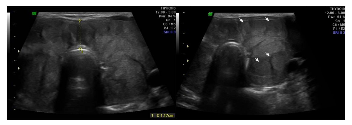
Fig-2: Multinodular Goitre: Diffuse Bulky thyroid with multiple Isoechoic and hypoechoic nodules.

Fig-1 Colloid Nodules ( a ) Well-defined hypoechoic nodule with peripheral egg shell calcification ( b ) Extensive honeycombing or cystic degenerative changes in right lobe of thyroid. Tiny echogenic foci with comet tail artifacts also noted within the nodule.