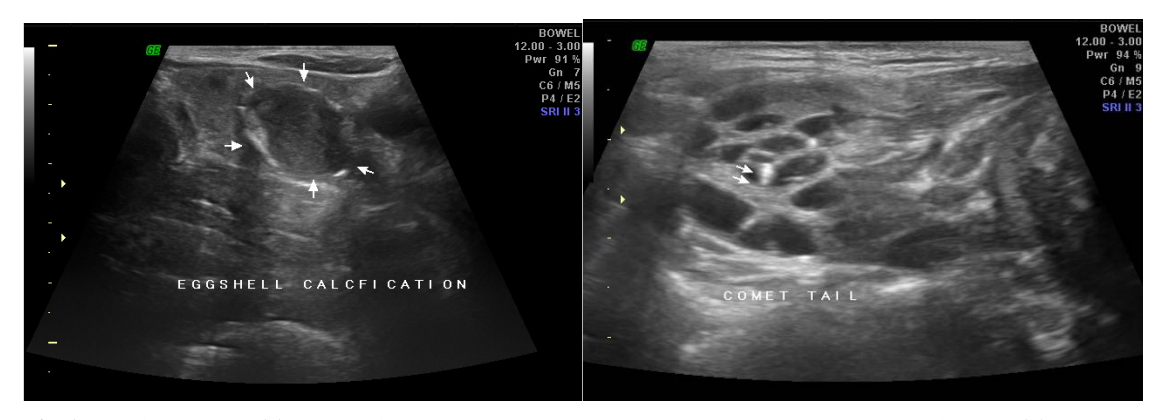
Fig-1 Colloid Nodules ( a ) Well-defined hypoechoic nodule with peripheral egg shell calcification ( b ) Extensive honeycombing or cystic degenerative changes in right lobe of thyroid. Tiny echogenic foci with comet tail artifacts also noted within the nodule.

patterns of both Grave's disease and Hashimoto's thyroiditis were found to be similar in few cases. The only way to differentiate the two was on basis of vascular pattern. Vascular patterns (mean PSV) were significantly higher in the Graves disease rather than Hashimoto's thyroiditis. Our findings corroborate with findings of Erdogan MF et al. <sup>12</sup>