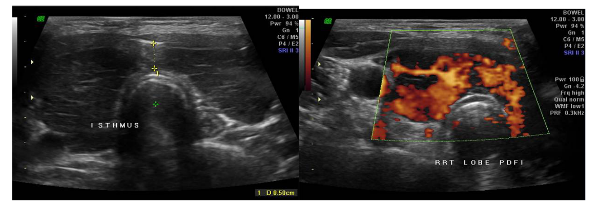
Fig-5: Hashimoto Thyroiditis: Diffuse enlargement of thyroid with multiple linear echogenic septations throughout the hypoechoic parenchyma. Power doppler shows increased vascularity in thyroid.