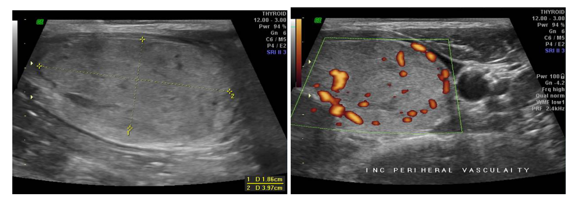
Fig-3: Follicular Adenoma: Well defined hyperechoic nodule showing peripheral and internal vascularity on PDFI.